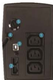
500VA - 800VA