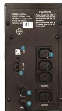
1500VA - 2000VA