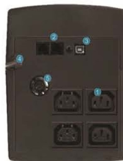
1200VA - 1500VA